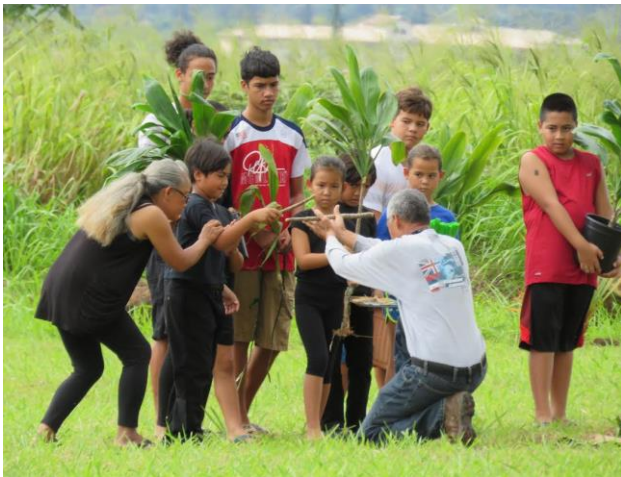
Haumāna bring lau kī to plant...mahalo!

Nā ho'okupu...hula, lei kupukupu, nā lei lau kī wili-style, and their authored and illustrated puke mo'olelo were offered by haumāna.