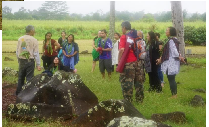
Piko Listening Journey