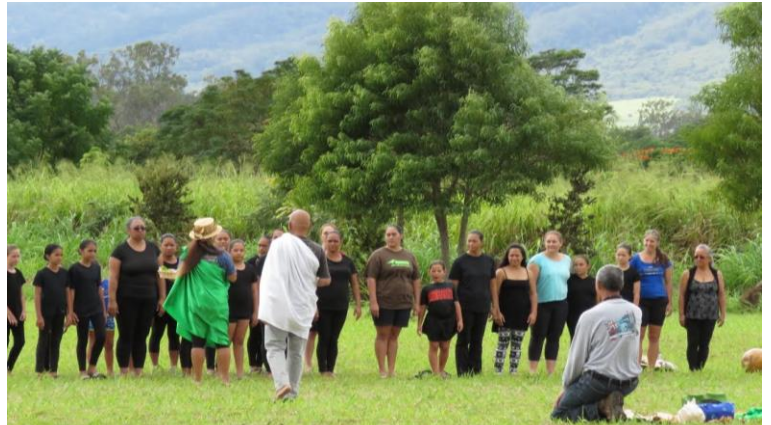
"Mai kākou e pu pa'akai" come and share salt with us... was a prayer offered with ho'okupu ki'eke pa'akai pu'upu'u for each visitor...