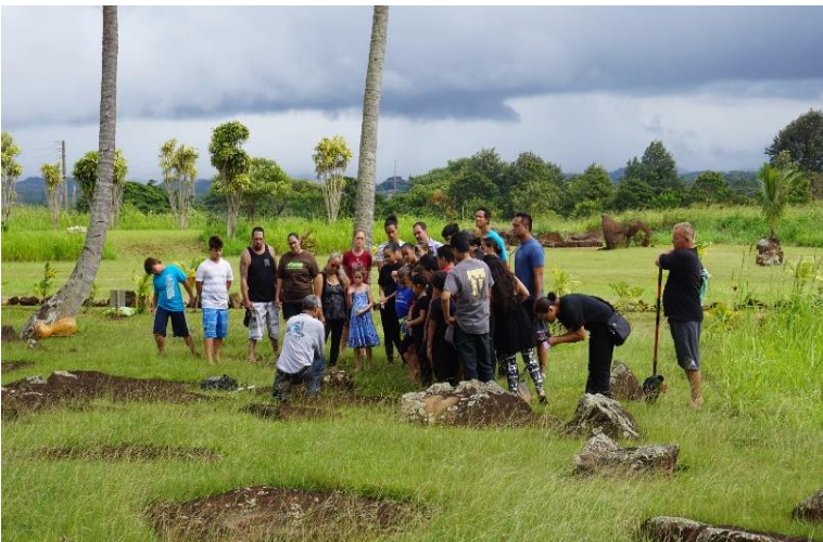
Mid-autumn skies were filled with rain clouds, but, no ua fell on this day. Haumāna were attentive to their Piko Listening Journey...